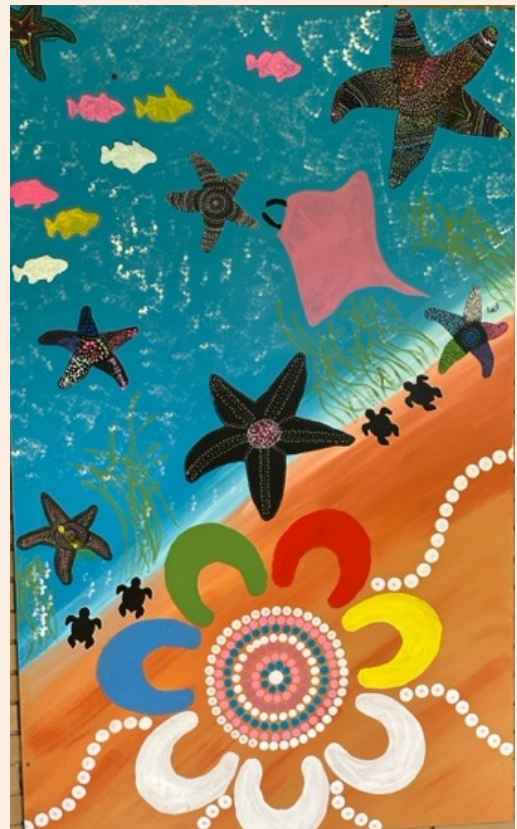
Artwork created by the Seahorses

Tuesday 23rd May Optional free dental check up